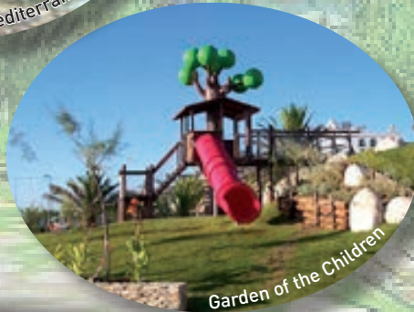
Garden of the Children