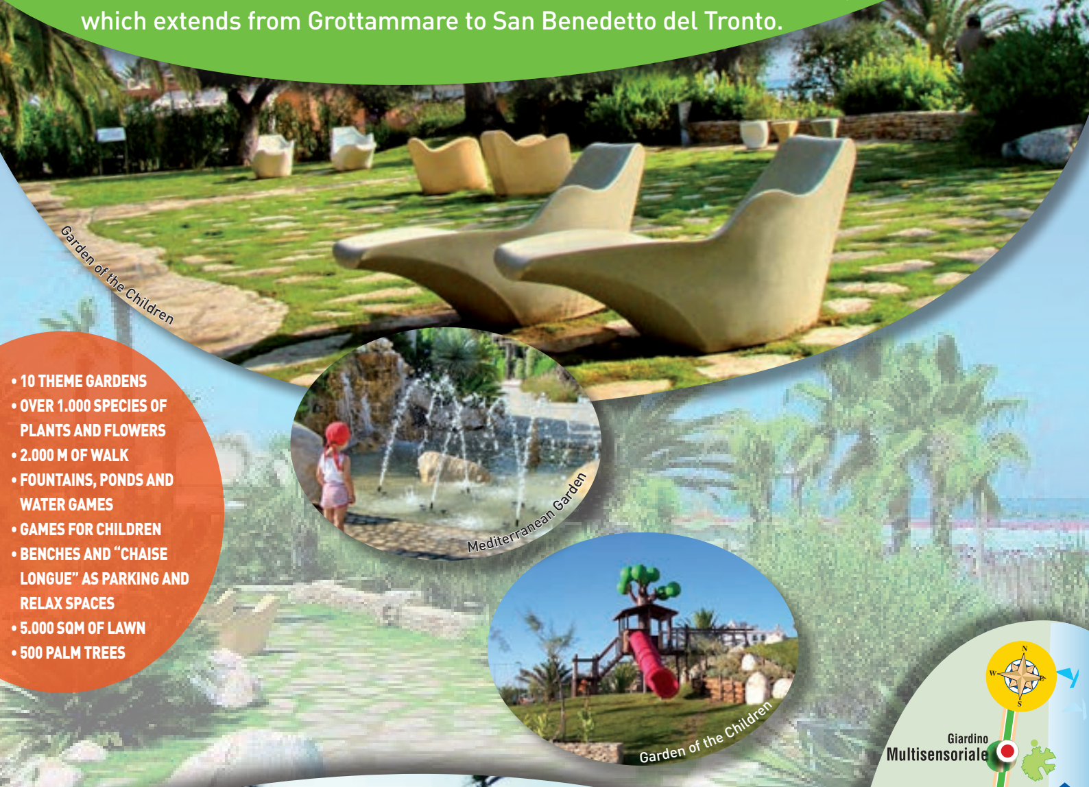
Garden of the Children

Not to miss the wonder of the Theme Gardens of the south Seafront Promenade of the exotic Riviera of the Palms, which extends from Grottammare to San Benedetto del Tronto.